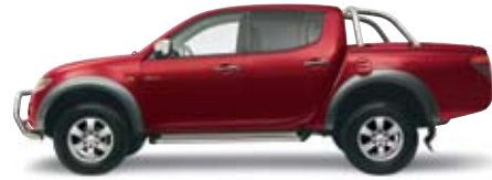
RED PLANET (M)