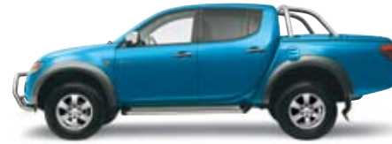
CYBER BLUE (P)*