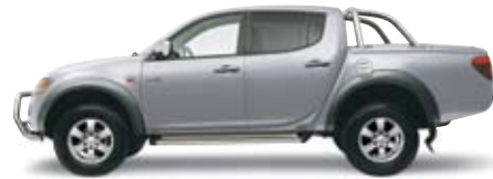
COOL SILVER (M)